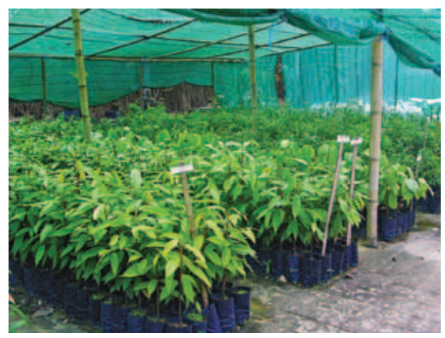
Figure 6: Example of nursery set up for a peat rehabilitation project.

A seedling nursery bed can be built using cement bricks into a structure that looks like an open box. The bed is filled with sandy loam or crushed coconut fiber. This is for sowing seeds.