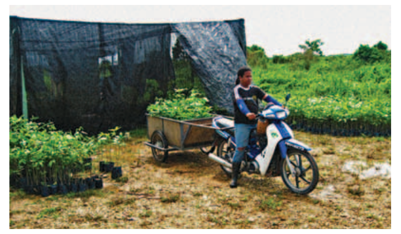
Figure 11: Transportation of seedlings at the planting site