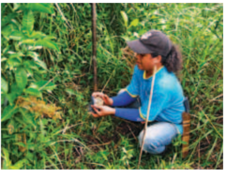
Figure 10: Removing polythene bag from seedling to be planted.

Most seedlings of species from the peat swamp forests grow slowly. Depending on site conditions, fertilizer applications may be necessary. It has been suggested to use 100g of controlled release fertilizer (15% N: 15% P_2O_s : 15% K_2O ) in each planting hole.