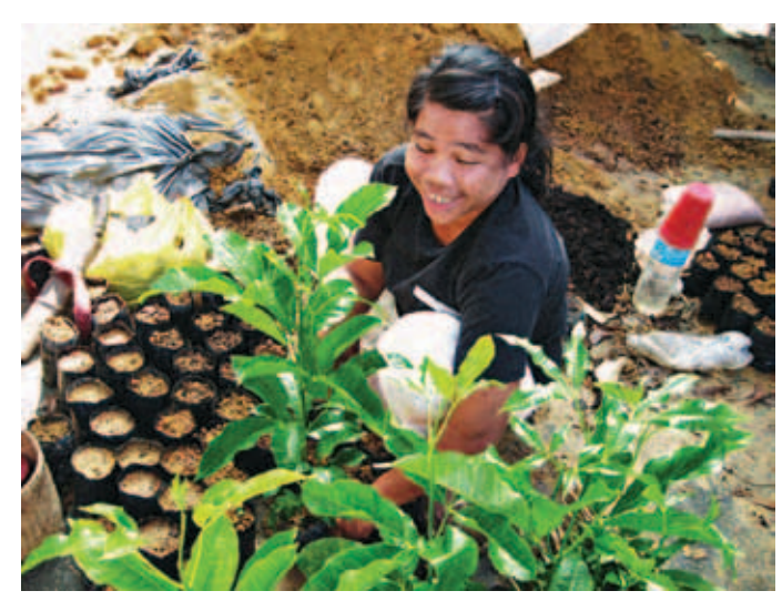
Figure 7: Putting wildlings in polythene bags.

Polythene bags used for peat swamp forest seedlings need to be generally large and taller than the highest water levels. Water levels beyond the crown of the seedlings often result in seedling deaths. However, seedlings may survive even though the base of the seedlings was underwater for a period as long as 18 months (Nuyim, 2003). It should be noted that transferring seedlings to planting sites can be rather difficult and especially cumbersome with large bags. Therefore, it is advisable to use polythene bags of mixed sizes.