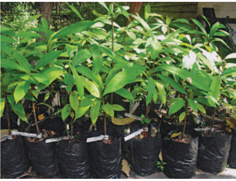
Figure 4: Jelutung seedlings at a nursery.

There are also several palm species that can be easily planted on peat e.g. red pinang palm ( Cyrtostachys renda ), salak hutan ( Salacca magnifica ), sago palm and some species of wild pandan.