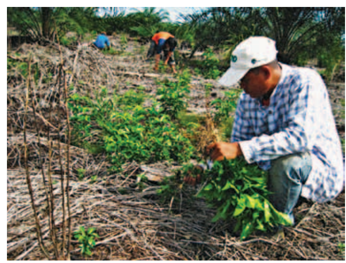
Figure 5: To supplement wild seed supplies, wild seedlings can be collected.

Planning to ensure an adequate supply of quality seedlings requires planners to be well-informed of the types of seedlings to be used for planting. Requirements include the planners' prior knowledge about the quantity of seedlings required for planting and replacement planting, size and height of seedlings suitable for planting, time for planting, as well as planting patterns and conditions. In addition, good planning for quality seedlings requires the planners to make additional plans for collecting seeds, determining seed sources and the collection season. Certain seeds have to be sought from distant areas. Planning for the production of seedlings of wild plant species requires more attention than the preparation of fruit tree seedlings or seedlings of economic species. Seedlings of fruit trees and economic plants are commonly found and can be acquired from other sources too. Wild plant seedlings are cultivated by only a few nurseries.