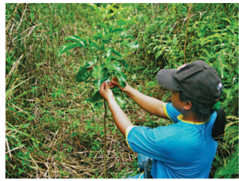
Figure 12: Tagging and monitoring of planted saplings.

A plot for studying plant growth should be a permanent plot of 40 \times 40 meters. Each rehabilitation project area should have at least 4 study plots, sited at different locations in the project area. Each plant in the plot is labeled with an identification number. The trunk size and crown height of each plant are measured. The trunk size is measured at 20 centimeters above the ground. A mark with red paint is made around the measurement point on the trunk. When the plant grows taller, measure the trunk at 1.3 meters above the ground. Repeat the measurement every year. A plan should be mapped out before collecting the data; all necessary tools such as notebooks should be prepared beforehand. Other information that should be collected includes a description of general surroundings, flowering and fruiting period, and diseases and insects found. To obtain reliable data on water, surveyors should install a water gauge and measure the water level monthly.