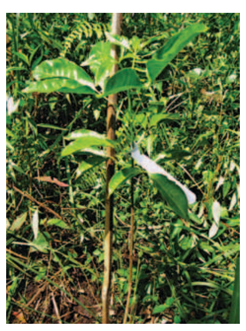
Figure 9: Planted sapling with bamboo pole.