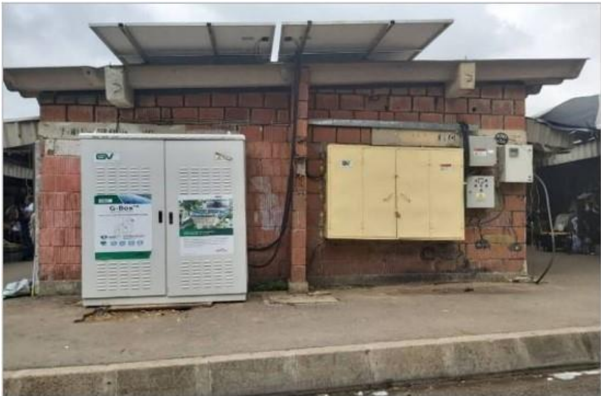
IMG installation at Wuse Market, Abuja, Nigeria.

This guidebook summarizes a broad range of policy and financial instruments that governments can implement to foster the development of the IMG market, driven by the private sector. They have been divided into five categories: broad strategy and target-setting, policy and regulation, administrative processes, financial instruments, and other supportive measures.