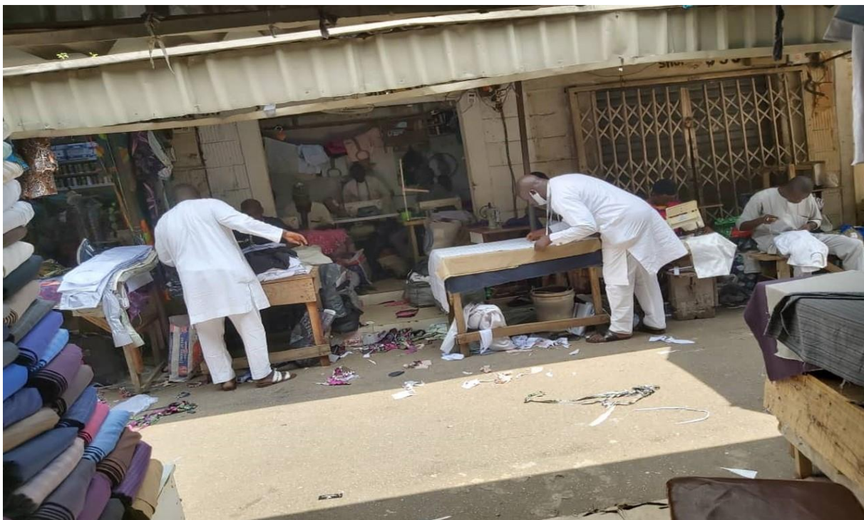
Wuse Market in Abuja, Nigeria, partly powered by a PV IMG.

Administrative processes for obtaining licenses must be streamlined and simplified for efficiency. A minimal regulatory burden for the private sector allows companies to grow faster and encourages investment (Tenenbaum et al., 2018; Waissbein et al., 2013). If the domestic capacity for manufacturing IMG equipment is insufficient, customs procedures and tariffs must be minimized so that businesses can easily import this equipment at low costs.